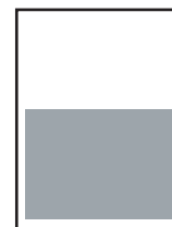
1/2 Page 8.5x5.5

TRIMMED: 8.5"x11" with 1/8" bleed. (live area for ad is .25" less than trim size.)